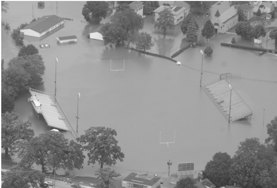
Figure 2. Oblique Aerial photograph showing severity of damages to the city of Fond du Lac the morning after the event.