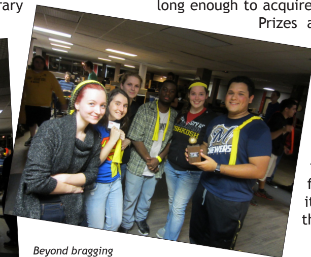
Beyond bragging rights, Human Team Winners and the Most Effective Zombie left with a trophy and some free pizza certificates.