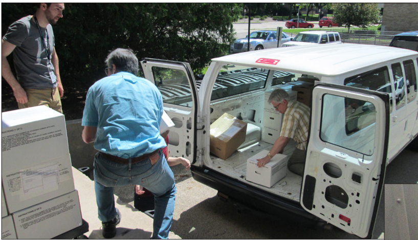
Wisconsin Historical Society staff drop off the Thomas Petri papers to Polk Library.

Preparing the records for research will take time. Currently, two interns, one each from the Departments of Political Science and History are reviewing and inventorying each folder of materials shipped from Petri's Washington and Fond du Lac offices. From these efforts an archival finding aid will be produced to assist researchers in locating information. The Archives' partners at the Wisconsin Historical Society are handling the digital record component of the collection. The archives hopes the collection will be available to researchers by the end of the spring semester.