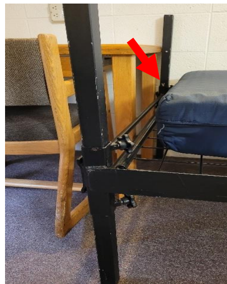
Donner / Webster Room Lavout