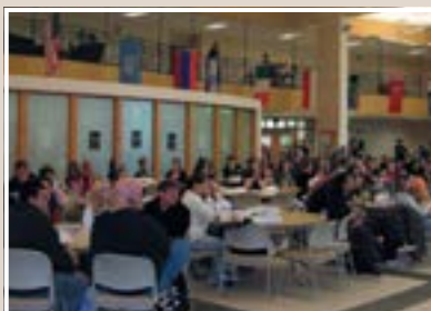
Participants listen to the opening remarks at the Student Leadership Summit in the UW-Fond du Lac University Center Commons.

In the first collaboration of its kind, the four institutions of higher education in Fond du Lac County jointly sponsored a free Student Leadership Summit on October 7, 2009, at the UW-Fond du Lac campus.