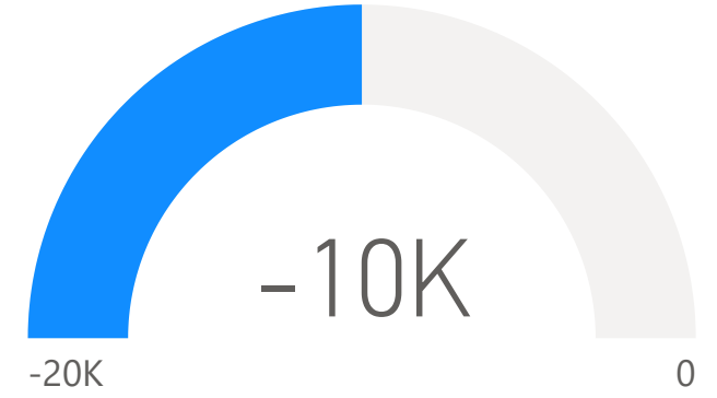
Other Financial Impacts