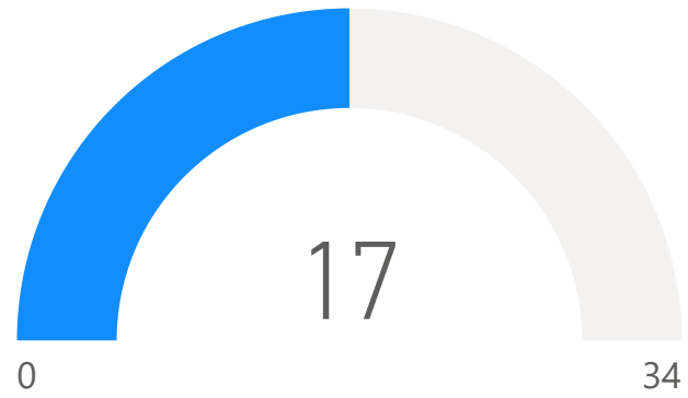
Count of County