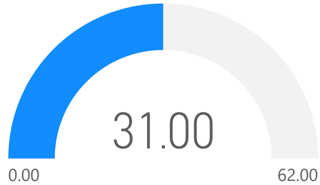
Change in FTE