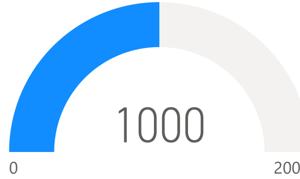
Wage and Productivity Change