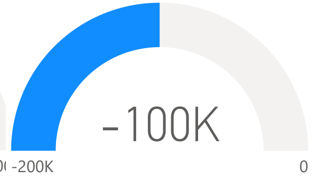
Other Financial Activities