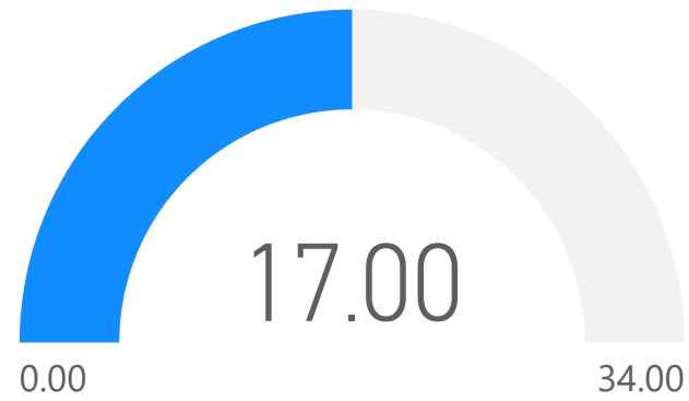
Change in FTE