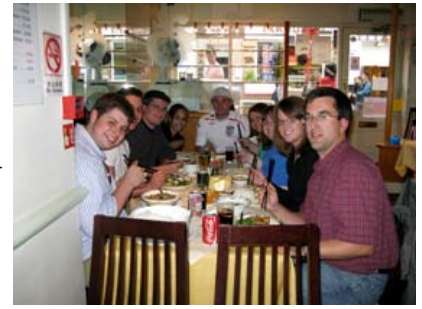
(London Group 2008)