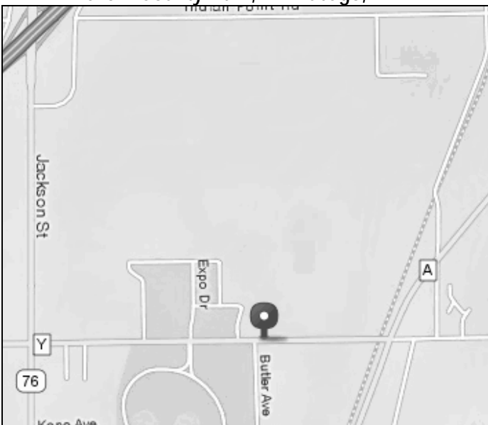
Coughlin Center 625 E County Rd Y, Winnebago, WI