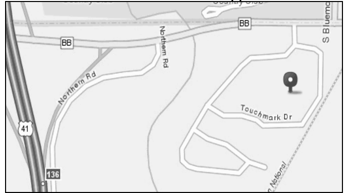
Touchmark 2601 Touchmark Drive, Appleton