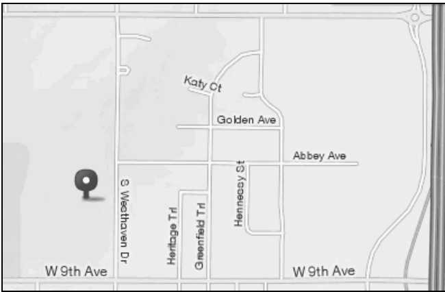
Franciscan Courts (across from St. Raphael Church) 815 S. Westhaven Drive, Oshkosh