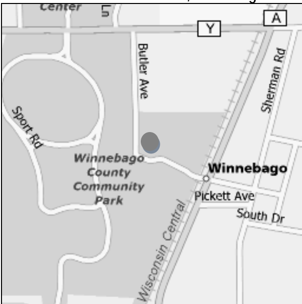
Park View Health Center 725 Butler Avenue, Winnebago