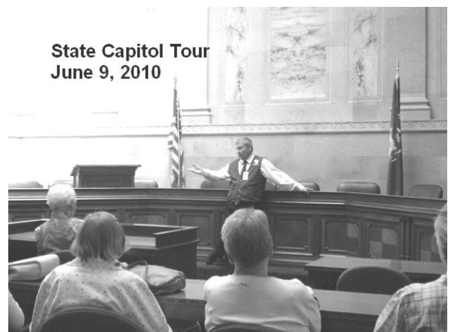
State Capitol Tour June 9, 2010