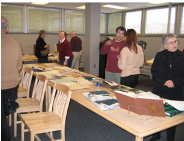
right - More views of the Archives open house