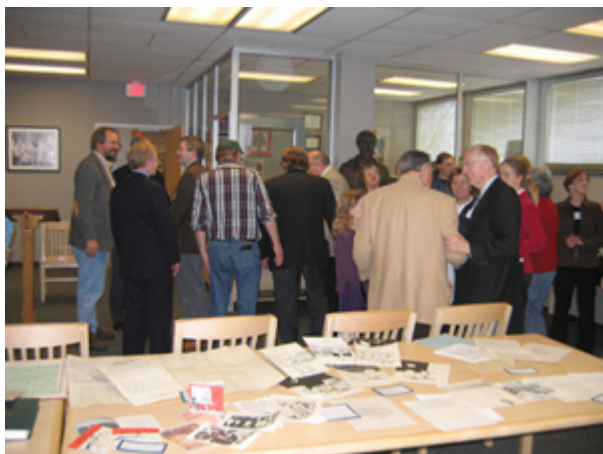
left - University faculty and staff, members of the library community, and friends of the Archives mingle at the open house