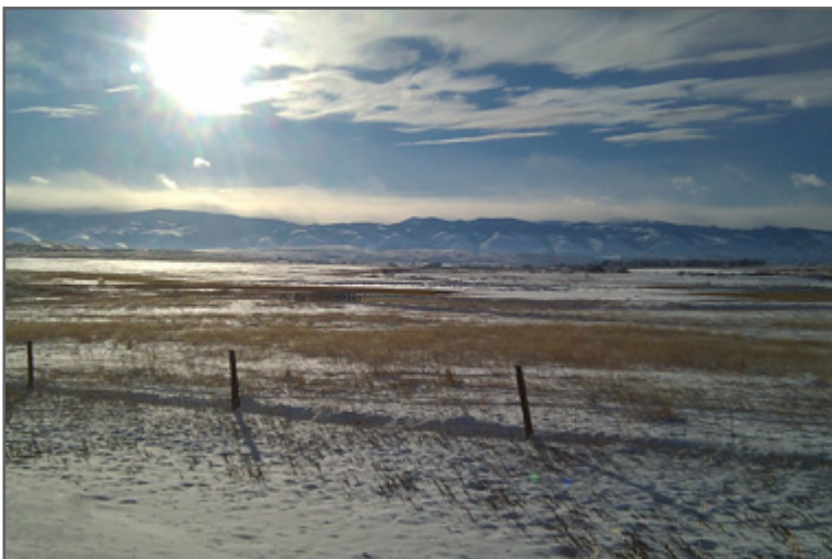
The College is located among the stark beauty of central Wyoming.