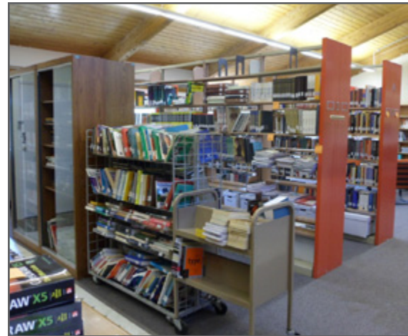
The Wind River College library under development.

Hardy and Sarah Neises , Polk's Head of Public Services, first traveled to the Wind River reservation in west central Wyoming in January 2011. Both returned this past summer and Neises traveled a third time in September. They worked with the library to start a weeding project to remove dated and out of scope research materials based on new collection development guidelines Hardy created. Neises helped develop a forthcoming library web presence and trained staff on using their cataloging and circulation systems. The pair also worked with the staff to figure out the best use of the library's limited spaces and on the use of UW Oshkosh's databases to which dual enrollment students would have access.