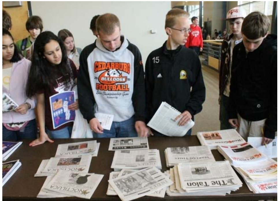
Students at the NEWSPA spring conference comparing papers from other schools