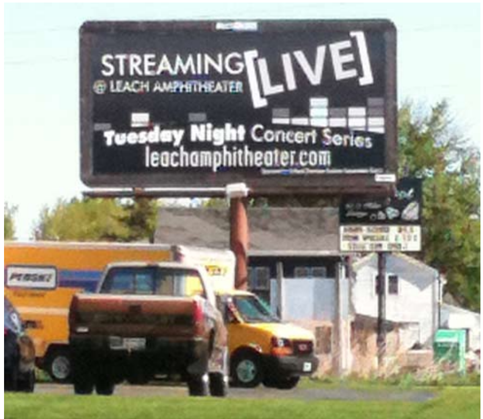
This billboard on Jackson Street uses the logo designed by the 2011 advertising campaigns class