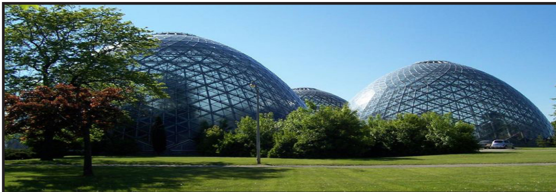
The Domes at the Mitchell Park Conservatory in Milwaukee