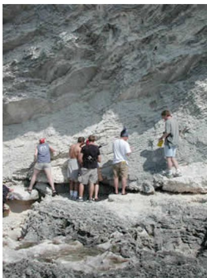
UW-Oshkosh Geology students

examining large-scale cross beds in Bermuda.