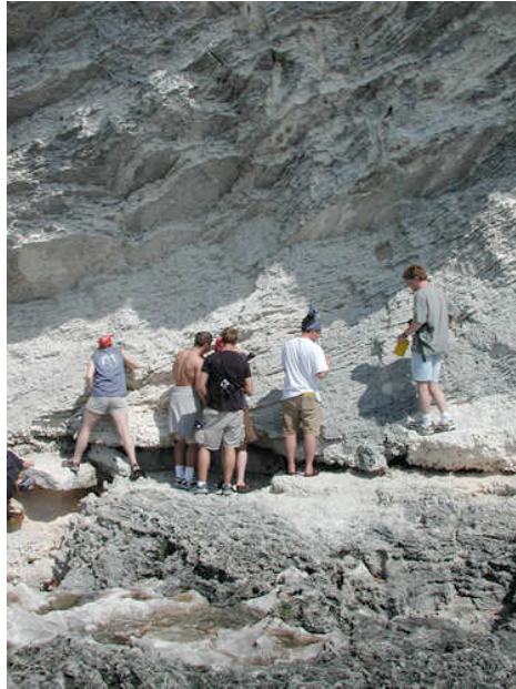
UW-Oshkosh Geology students examining large-scale cross beds in Bermuda.

Grades: Laboratory* 25% Exam 1 15% Exam 2 20% Reports† 20% Final Exam 20%