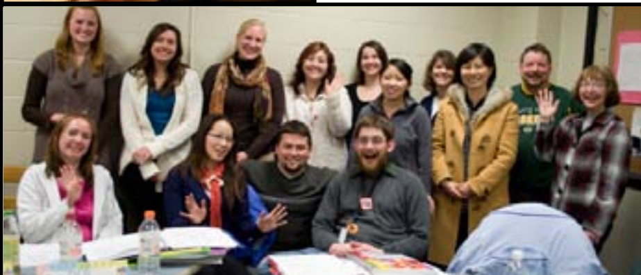
Students gather together in 765 Literacy Assessment